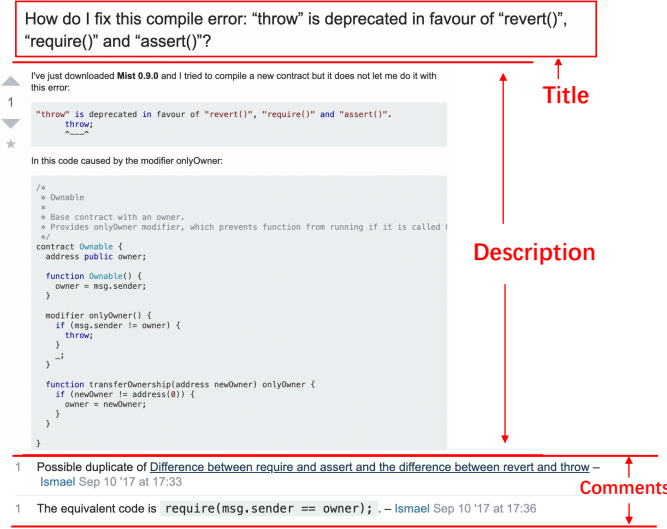
Fig. 1: Example of a Card